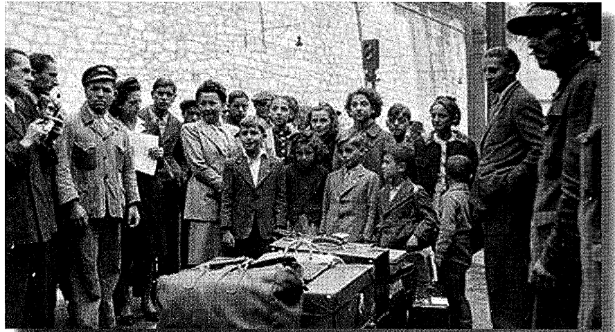
Children from Spain at the Rossio railroad station in Lisbon prior to sailing on the SS Serpa Pinto, September 1943.