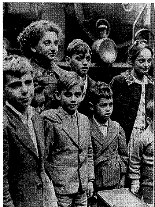
A group of French refugee children arriving from Marseilles via Spain at the Rossio railroad station in Lisbon, September 1943, to board the SS Serpa Pinto .