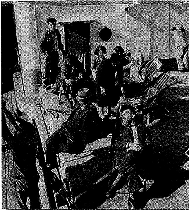
View of passengers relaxing on the deck of the SS Serpa Pinto , which carried Jewish refugees from Europe to New York and other Western ports, c.1943.